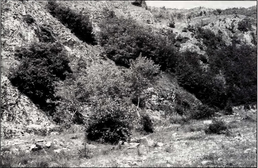
Figure 2. Habitat of Spialia phlomidis (H.-S.) in the Struma Valley, Zemen Gorge, Bulgaria.

Zemen Gorge, Skakavitsa. The discovery of Spialia phlomidis here represents a significant extension of the known range of the species. All the specimens collected here have been found flying in a dry calcareous river bed (Fig. 2). The first date of collection, 15 June, also extends its flight period; all the previous records have been from July (11, 15) (Krzywicki, 1981: 45, Kolev, 1994: 152). Natural hostplants and early stages still remain unrecorded in Europe (Tolman & Lewington, 1997: 266).